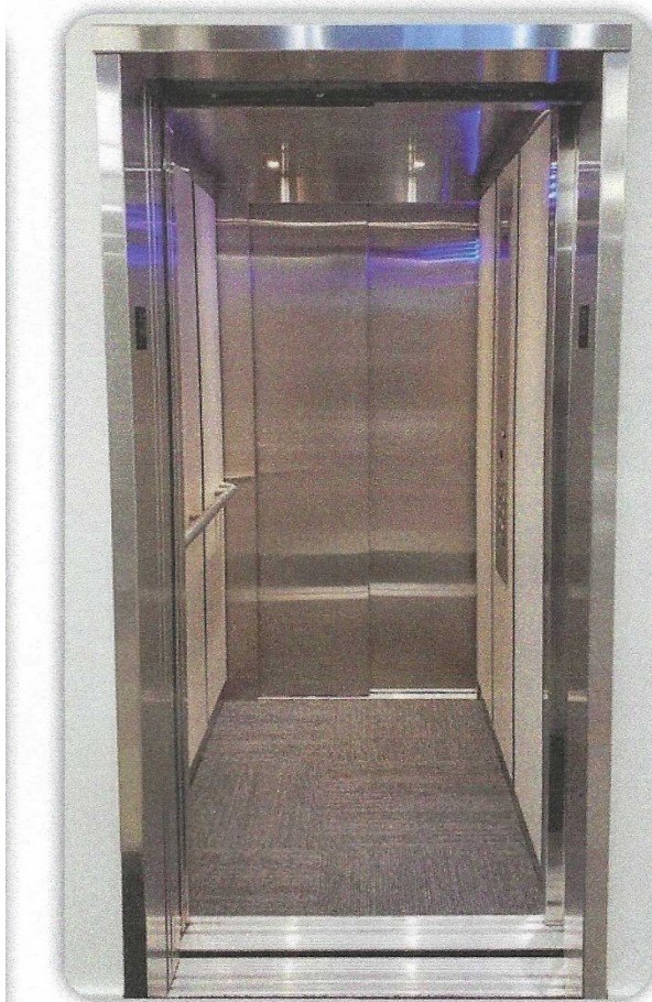
Optional Brushed Stainless Steel landing and hoistway doors