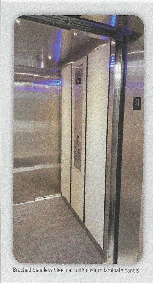
Brushed Stainless Steel car with custom laminate panels